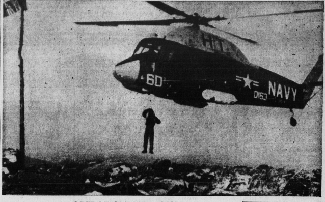
OPERATION CARIBOU Being lowered by derrick from a U.S. Navy jet helicopter is one of the biologists for the state of Maine on the northwest plateau of Mt. Katahdin. They were taken to the plateau to release caribou that were airlifted by the state of Maine on the northwest plateau of Mt. Katahdin. The animals were released in an area where caribou once thrived. (AP Wirephoto).

Every spreader load you spread this winter, when time is available, is one less load to spread next spring, when time is vital. Did you know New Idea have a special spreader for winter spreading. Won't freeze up, spreads frozen manure, or chunks of frozen clay or ice. Yes that's right, the No. 293 New Idea full type spreads just about anything. We think it's the most versatile and amazing spreader ever built. That's why we are offering a special price for December only, or until our present supply is exhausted. No. 293—130 bushel, P.T.O. flail type. Regular price is $853.40 on 20" DCR. Now a special $100.00 off while supply lasts. Now—same spreader, same full year guarantee for $753.40. Come in today and make a "red hot" spreader deal. New Idea make—10—different models, and we stock them all! The Hall Mfg. Co. Ltd. Summerside