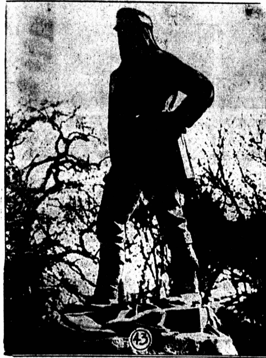
CLUE: To a man who died while travelling.

(421) St. Basil's Cathedral, Moscow. (422) Memorial Church, Grand Pre, N.S. (423) Grotto Shrine, Arizona, U.S.A. (424) Victoria Park Cemetery, London. (425) Sir Walter Scott Memorial, Edinburgh. (426) Ear of Dionysius, Syracuse, Sicily. (427) Kensington Gardens, London. (428) Church of the Holy Apostles, Salonika. (429) Admiralty Arch, London. (430) Shrine of the Little Flower, Detroit.