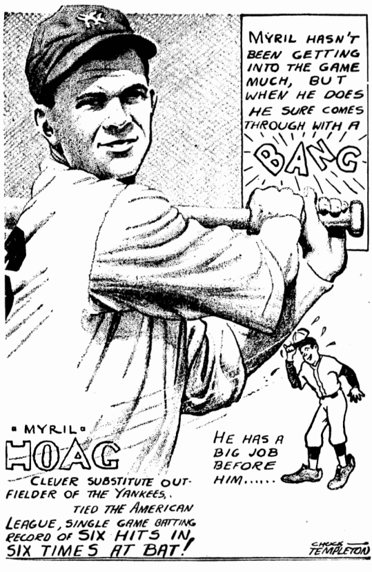
MYRIL HASN'T BEEN GETTING INTO THE GAME MUCH, BUT WHEN HE DOES HE SURE COMES THROUGH WITH A BANG. HE HAS A BIG JOB BEFORE HIM.....

MYRIL HOAG - CLEVER SUBSTITUTE OUT-FIELDER OF THE YANKEES. TIED THE AMERICAN LEAGUE SINGLE GAME HITTING RECORD OF SIX HITS IN SIX TIMES AT BAT!