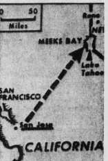
Arrow shows flight from San Jose, Calif., of a four-engine airliner which it overtook at Lake Tahoe airport in heavy snowstorm.

SEARCH IMPOSSIBLE Hamilton Air Force Base north of San Francisco said weather was "bad and deteriorating" as a new storm front due Sunday night. The air force centre said the weather was "so bad that heavy snow had been falling all day, that search was impossible."