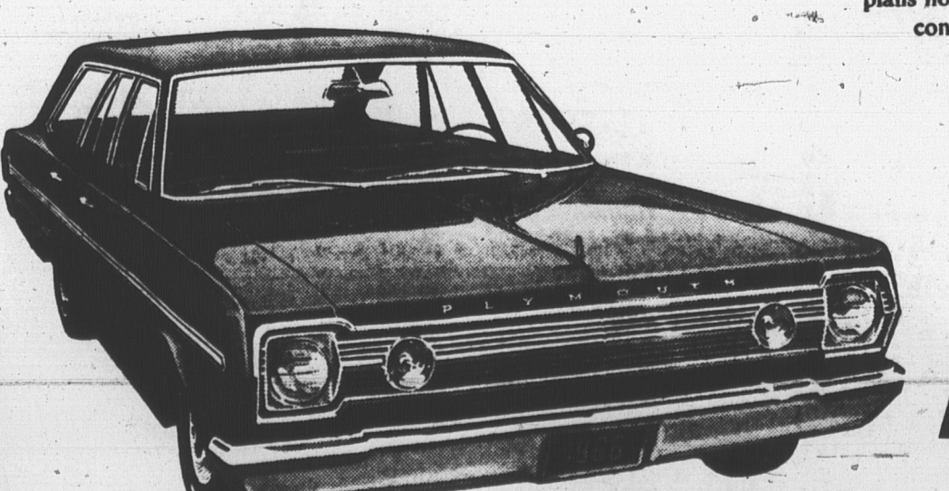
Belvedere II 6-Passenger Wagon. Wheelbase 117 ins. Also Available in 9-Passenger Model