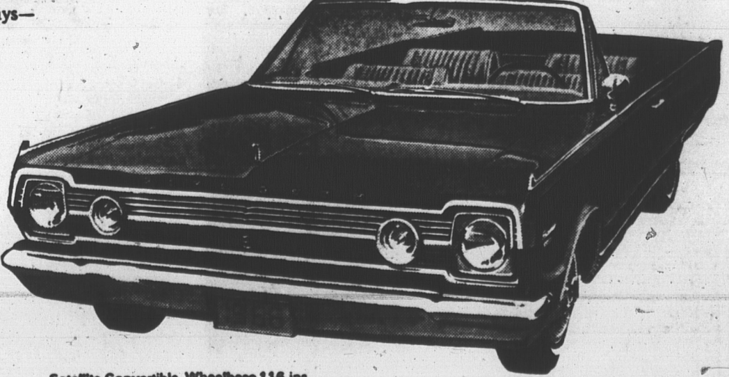
Satellite Convertible. Wheelbase 116 ins.

Let yourself go vacationing in the greatest line-up of Plymouths in Plymouth history! This summer, two great lines of bright and breezy convertibles, spacious fun-filled wagons to choose from—the big-action Fury and the hot new Belvedere! Every model standard-equipped with the biggest range of holiday-fun features ever. Every one a beautiful buy! Make your vacation plans now—around a big-action Fury or a hot new Belvedere convertible or wagon. As the Plymouth tiger says—'we're the gr-r-r-eatest tiger family in the land!' Go for fun! Go Plymouth —at your Plymouth dealer's—now!