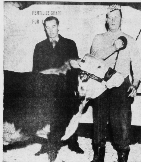
RESERVE GRAND CHAMPION AT SHOW

From the appearance of the animal shown at this year's annual Easter Beef Show and Sale last Thursday and Friday, there was ample evidence that Island stockmen need take no back seat when it comes to producing beef cattle of the highest grade.