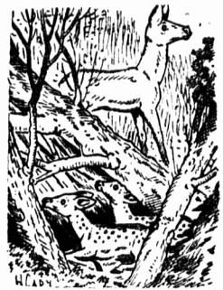
She made them crawl under a pile of fallen trees.

Mother Lightfoot shivered. She wasn't cold. You know, people shiver from fear as well as from cold, and that was what was making mother