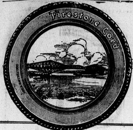
One of the world's longest bridges—nearly two thirds of a mile—spanning the St. Lawrence at Quebec.