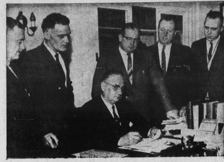
Signing of the New Plant Agreement Charlottetown, 28 Nov. 1962

O. K. Tire SNOW TIRES For town and country Driving NEW TREADS 750-14 9.95 each With Recappable Tire Lifetime Road Hazard Guarantee All sizes of new Snow Tires Available OK 1475-1485 St. Peters Road Partridge