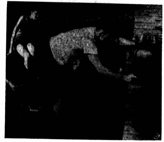
If you want to lose your motor overboard, this is a good way to do it. Have boat moored securely while putting motor aboard.

It all depends on you. If you learn a few basic things about handling a small boat, your vacation or week-ends afloat will be pleasant—and SAFE. Last year hundreds of people were drowned in boating accidents, many of them due to ignorance of boat handling or, carelessness. No one knows how many uncomfortable, but non-fatal accidental dunkings were suffered. The American Red Cross conducts regular classes to teach its members water safety. Illustrated here are three common traps for the unwary amateur sailor. One thing the Red Cross stresses—if your boat or canoe capsizes or fills with water stay with it. It will not sink, even with an outboard motor attached. Many good swimmers die in boat accidents every year because they leave the boat and try to swim to shore.