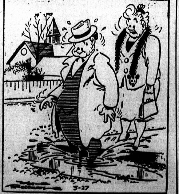
"See, you'd have wet feet—if you hadn't bought those rubbers I saw in the Guardian Want Ads!"