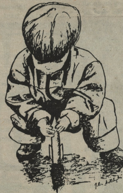
HAS IT BECOME A CHILD'S GAME? A CHILD'S GAME, WITH OUR LIVES?

"The cruise missile has a clear first use function — it means you commit a nuclear lobotomy on the body politic by knocking our command, control, communication and intelligence centers," he said,