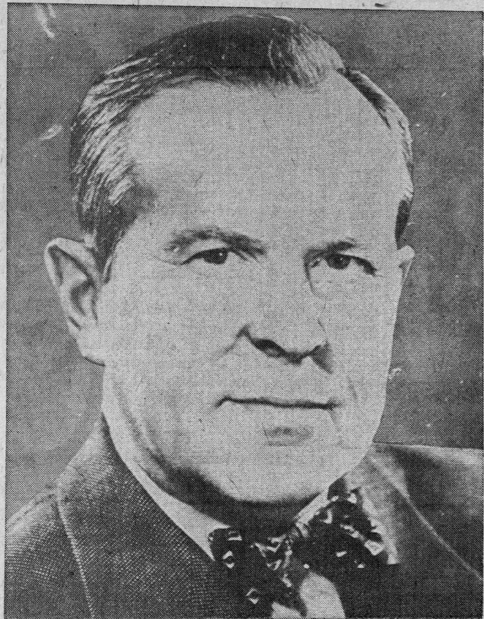
HON. LESTER B. PEARSON