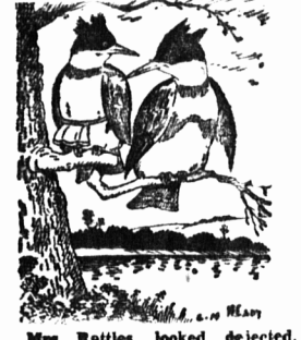
Mrs. Rattles looked dejected. "I'm tired," she confessed.

Mrs. Rattles had done most of the sitting on the eggs to hatch them. But Rattles was doing his full share of feeding the big family. The two were over at the Big River. They just happened to be sitting in the same tree resting while they watched the water below for a fish. Mrs. Rattles looked dejected. "I'm tired," she confessed.