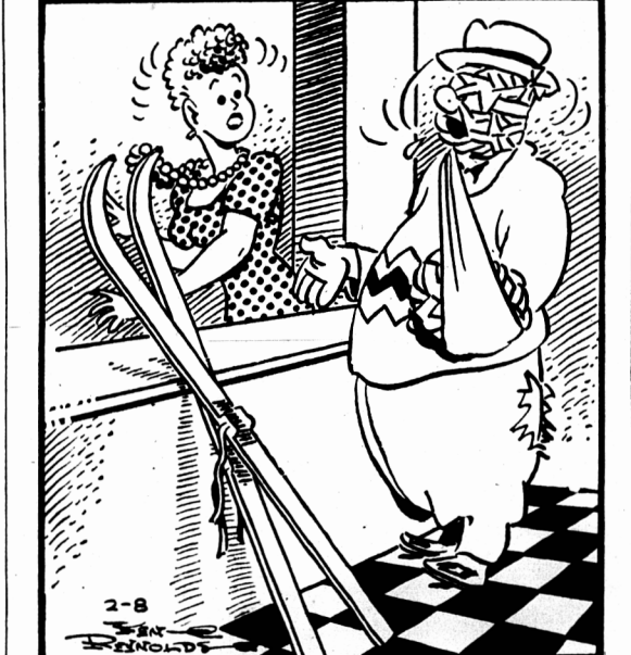
"... I'd like to sell these slippery little rascals with a Guardian Want Ad!"