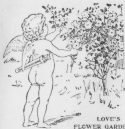
LOVE'S FLOWER GARDEN.