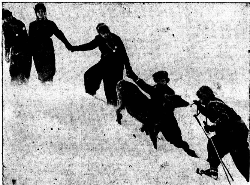
Famed Dionne quintuplets have all kinds of pets, ranging from kittens to horses, but the one that now gives them the most pleasure is "Bambi", a deer they found and raised. Shown are, from left, Emily, Marie, Annette, Yvonne, Cecile, with beloved companion.