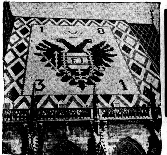
PATTERN FROM THE PAST — The coat of arms of the old Austrian empire is the motif of a novel decorative tile roof just completed on St. Stephen's cathedral in Vienna. The old roof and much of the interior of the 800-year-old church were destroyed during World War II.