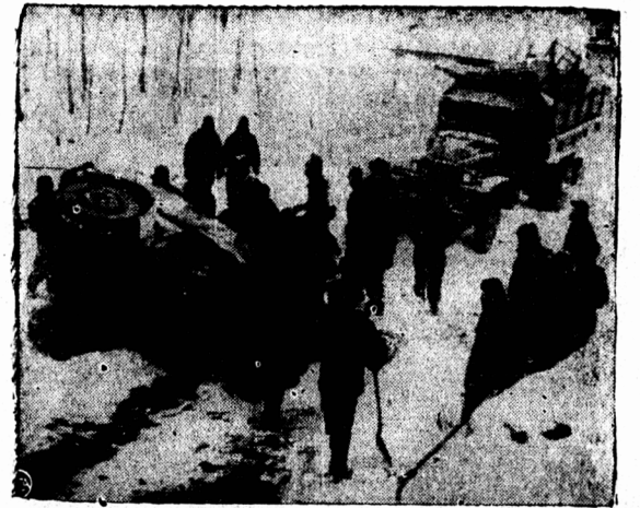
OPPOSITION WEATHER—American soldiers gang up on an overturned truck trailer to get it going forward again on the snowbound road near Wonju. The weather and the difficulty of moving a modern army through the rough mountain country has permitted the bulk of the Communist armies to escape encirclement in the latest U.N. drive.