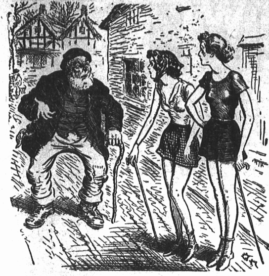
"Are you the oldest inhabitant?" "No, I'm the village idiot. I've come without my glasses." -Humorist.