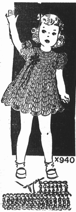
DESIGN NO. X 940

When the young toddler from 9 to 18 months starts on her initial tour of discovery she will have to have some serviceable dresses that can stand wear and tear.