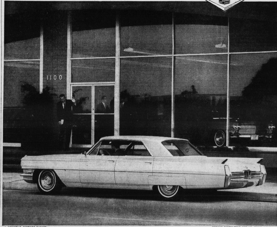
A GENERAL MOTORS VALUE SERIES SIXTY-TWO SEDAN (FOUR WINDOW)

BEFORE THE SPEEDOMETER READS 30—HE'LL KNOW HOW NEW IT IS: