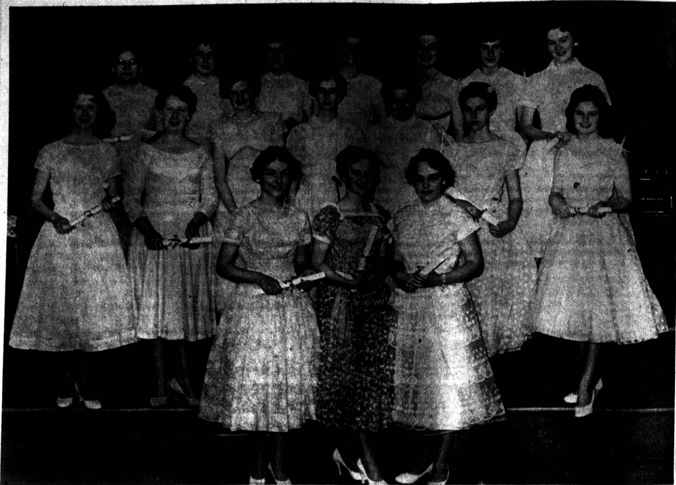
SENIOR GRADES AT ST. JOSEPH'S CONVENT

Grade Eleven, the senior class of St. Joseph's Convent, Charlotte town, took part in closing exer-