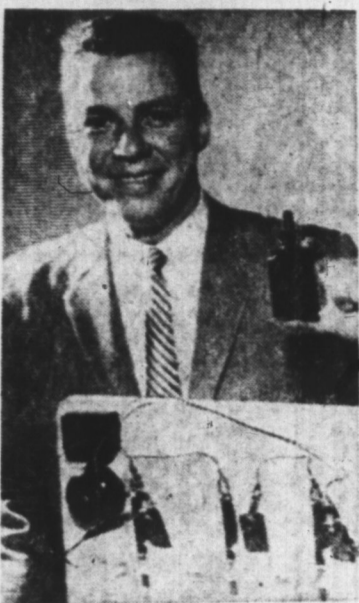
THE YOUNG man is holding "bottled sunshine", with which he converts chemical energy into enough electricity to operate a portable radio all day. Using a new, high efficiency energy converter called a "fuel cell", he also can make a "drop of liquid sunshine", lift weights, spin wheels, flash lights and ring bells. It is all part of General Motors of Canada Previews of Progress science stage show.

Previews of Progress already has been presented to thousands of persons throughout Canada. The Previews team carries 1,000 pounds of stage equipment in its panel truck.