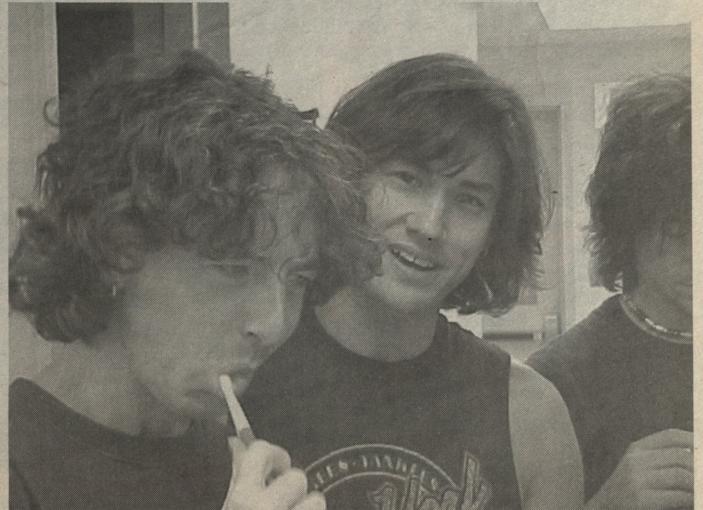
The David Usher. Always waiting for the camera.

Rock Out With Your Cock Out!* (*Actual backstage quote of a member of Usher's band, directed toward the Mudmen)