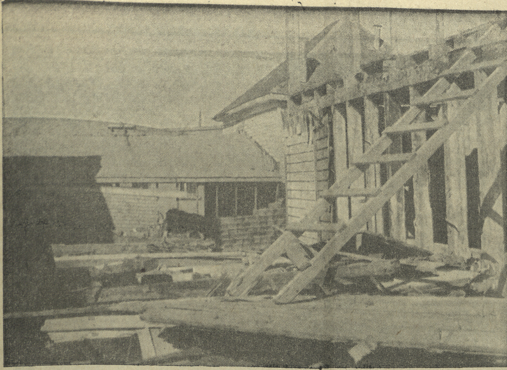
SITE OF PARKING LOT

Wooden warehouse formerly used by Brace McKay Ltd. in Summerside are being torn down to provide space which will be used for a town owned public parking lot. Located directly back of Brace's new store between First and Foundry streets, the