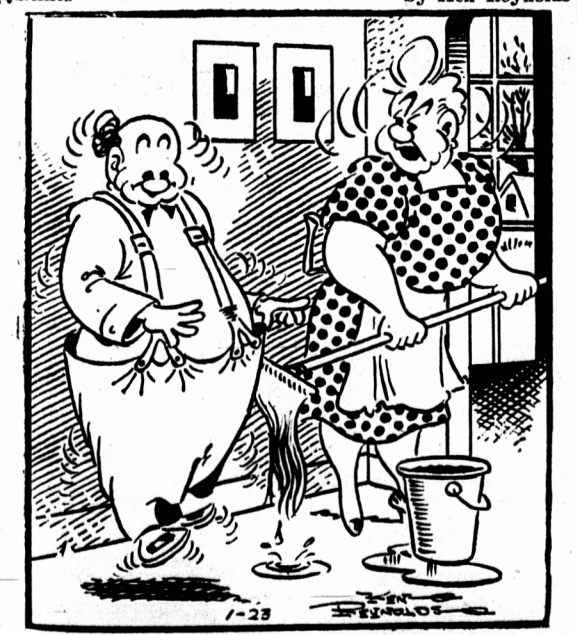
"Those suspenders you got in the Guardian Want Ads are strong, aren't they?"

Fort Fairfield, Maine, has been purchased by Castleton Farm, Lexington, Ky., and placed in the stud there. He is an exceptionally well bred horse and in his racing career as a two-year-old had victories over such stars as Hoot Mon 2:00 and Rodney 1:57 2/5.