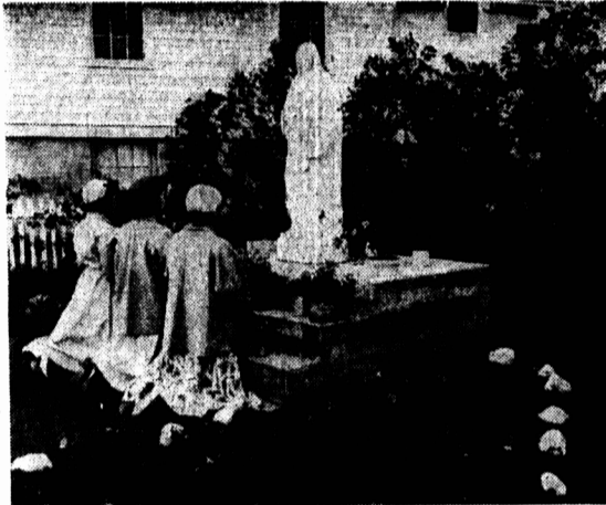
Worshippers at the Shrine of St. Anne, recently dedicated at Lennox Island which was visited by the large assembly taking part in the annual observance of the feast of St. Anne.