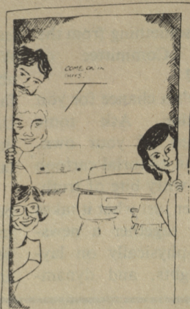
The Gem needs: