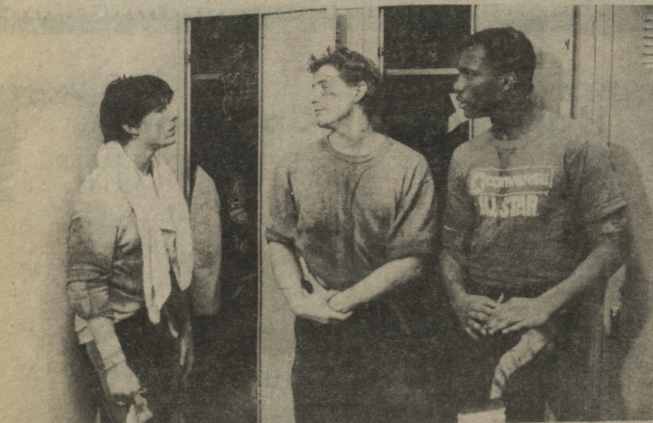
TOM CRUISE is Stef, a high-school senior who wants more from life than his Pennsylvania steel town can give him; Lea Thompson is his girlfriend Lisa, who is willing to sacrifice their romantic future to help him realize his dream.