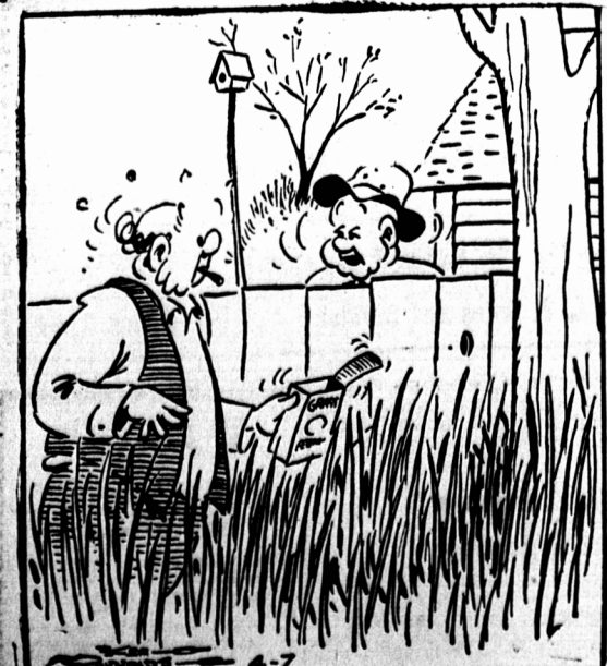
"That lawn fertilizer you got with a Guardian Want Ad—how's it working?"