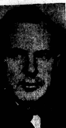
Hon. L. B. Pearson

Sir Oliver Franks, British ambassador to the United States, seen above with his wife, has rejected the offer of the secretary-generalship of N.A.T.O.