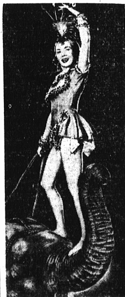
Actress Gloria Grahame trained many months for her role of Elephant Girl in Cecil B. DeMille's superb circus drama in Technicolor, 'The Greatest Show on Earth.' The Paramount picture is now at the Prince Edward Theatre with special Children's Matinee on Saturday morning.