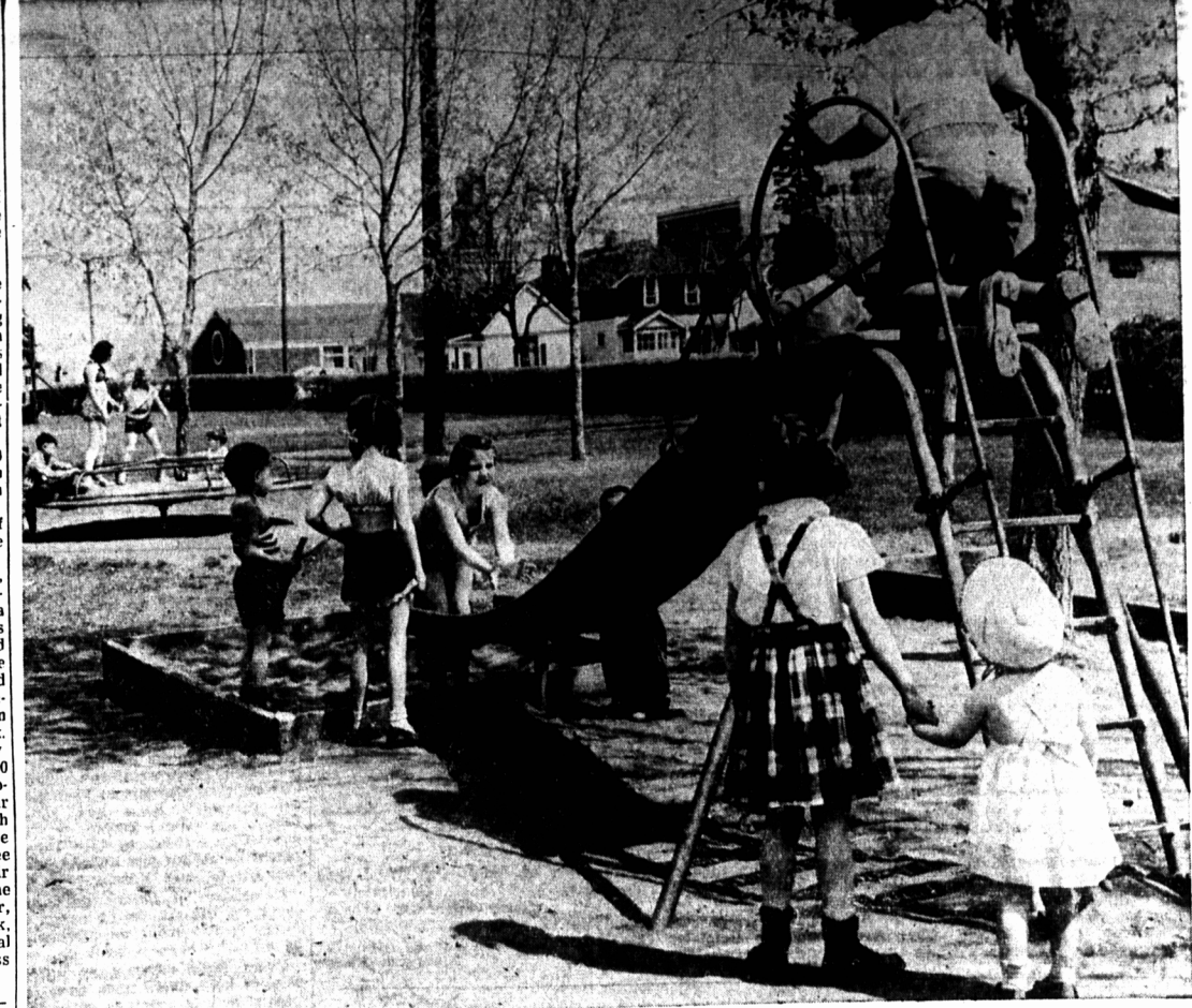
KINSMEN-BUILT PLAYGROUNDS FEATURED — Kinsmen-built playgrounds are featured in every major centre in Canada complete with fun-provoking generation to enjoy. Summerside and Charlottetown Kinsmen are not lax in providing equipment for such centres. The above picture is typical.