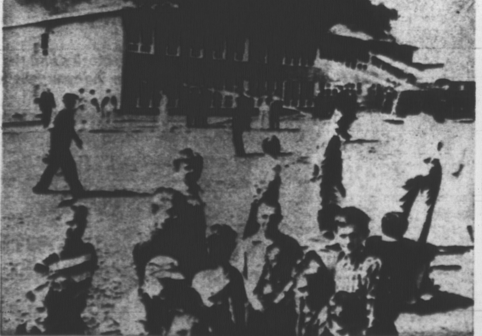
CLOSE CALL AS SCHOOL BURNS This stubborn fire, which destroyed Brightview public elementary school in Edmonton Friday, broke out only five minutes before students were to enter the frame structure to begin afternoon classes. An explosion occurred shortly after the fire broke out. There were no injuries.