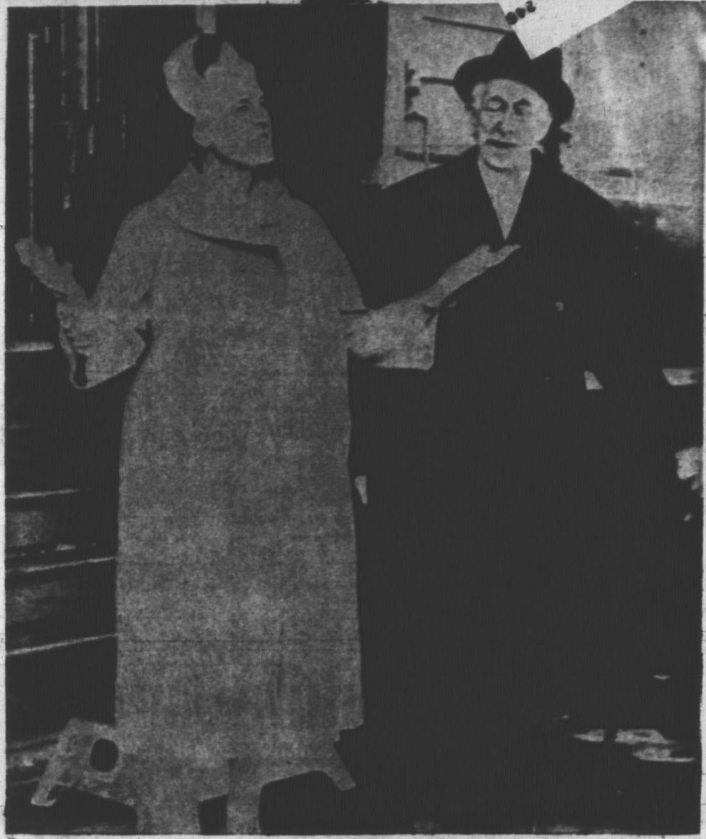
SNOW GONE FOR VANIERS

Authorized as Second Department Class, and