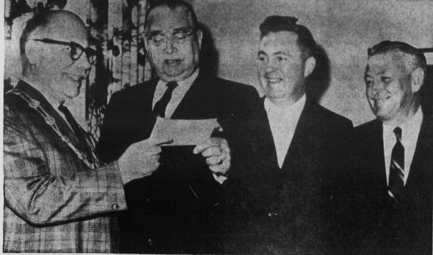
A CHEQUE for $24,228 was presented to the town of Summerside by the provincial government in a brief ceremony at Summerside yesterday. This