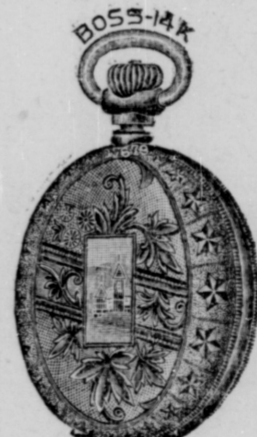
A. 7531 seeing your stock.

Don't Take Any Chances When You Buy a Watch