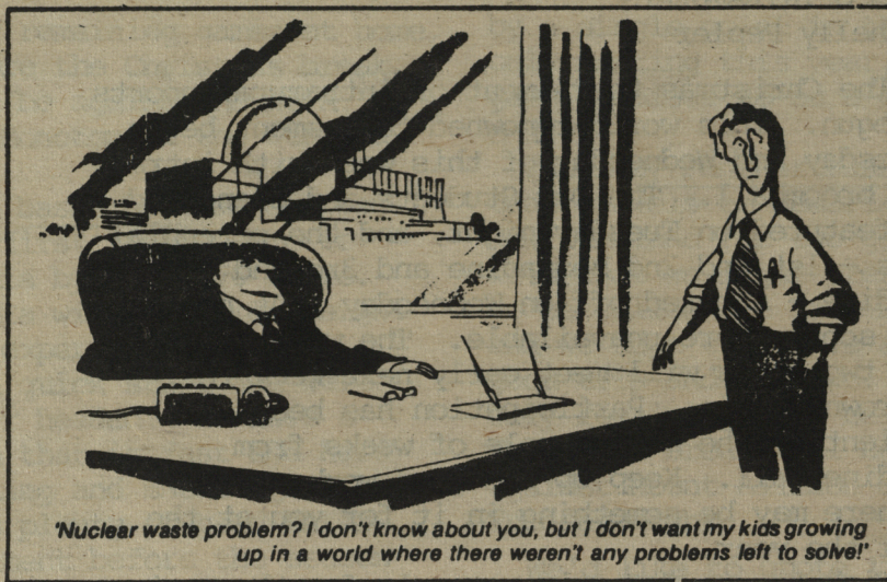
'Nuclear waste problem? I don't know about you, but I don't want my kids growing up in a world where there weren't any problems left to solve!'