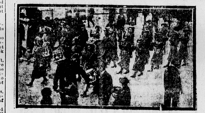
BAND OF LONDON SUFFRAGETS.

Special Correspondence. London, June 18.—"When words fail try music!" That's the slogan of the suffragets, and they have organized a woman's brass band which is going to play under the windows of the House of Lords to attract the noblemen to their cause.