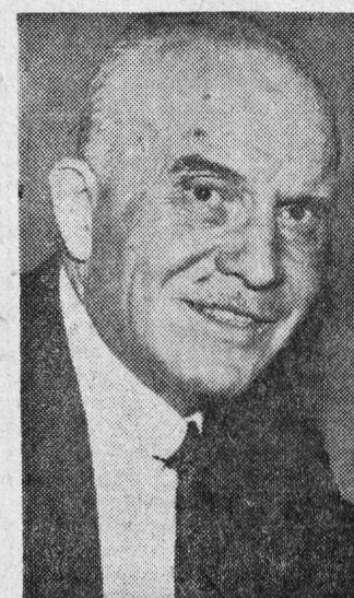
HON. GORDON CHURCHILL Trade and Commerce