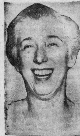
HON. ELLEN FAIRCLOUGH Secretary of State