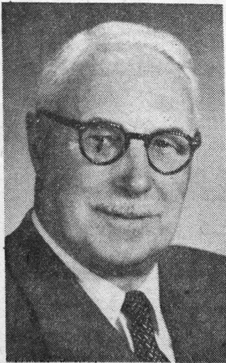
HON. GEO. PEARKES, V. C. National Defence