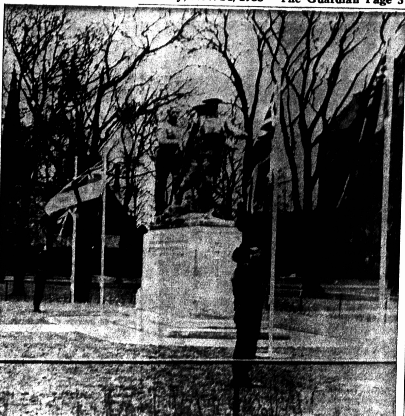
Starting on Remembrance Day the new flag staffs at the War Memorial in Charlottetown's Queen's Square, north of the Provincial Building. The Armed Services will take on the duty, month about, of ceremonially raising and lowering the flags.