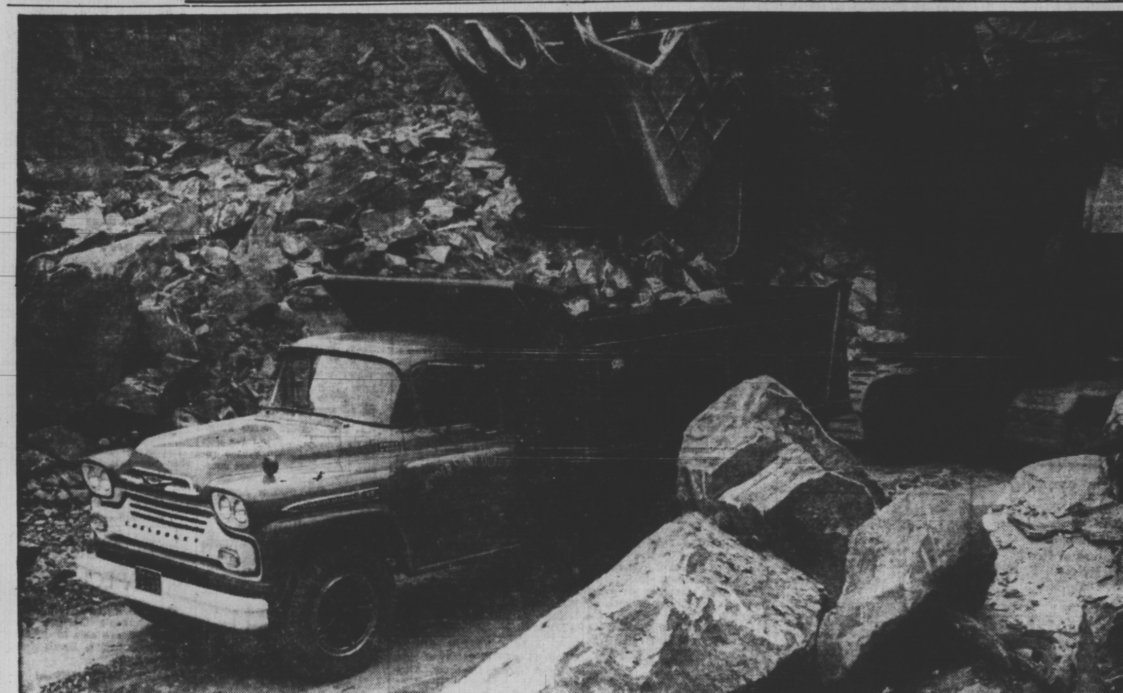
Stone quarry owner rates Chevrolet the toughest truck going

NEW WAY FURNITURE CO., LIMITED "The Maritimes Greatest Furniture, Appliance And Television Stores" Charlottetown, P. E. I. Phone 6211 161 Great George St.