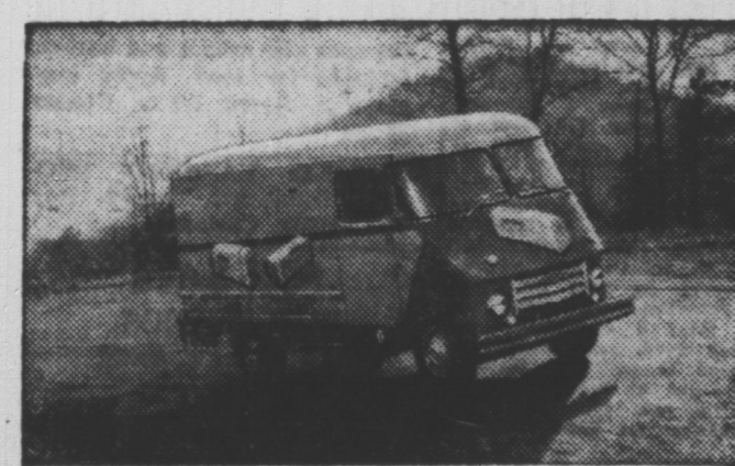
Cuts gas costs by 20% on multi-stop schedule! This bakery firm is sold on Chevrolet's "easy driving and fuel economy". Their Chevies keep at it 10 hours a day, averaging 78 stops, covering about 3,500 miles a month!

That kind of performance is a specialty of the house. Chevrolet turns out heavy-duty trucks that keep their poise no matter what you put in them. They're beating the big, oversized rigs at their own game, showing that precision-engineered chassis components and super-efficient V8 power make up for a locomotive-looking build any day of the week.