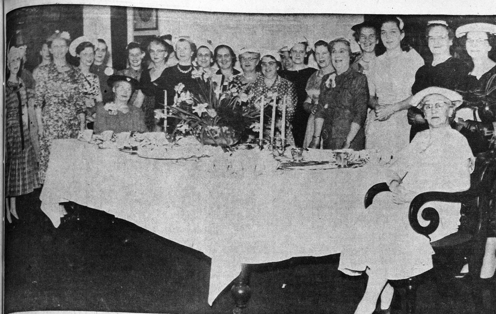
AFTERNOON TEA IN THE CONFEDERATION CHAMBER

Members of the Charlottetown Liberal club are shown