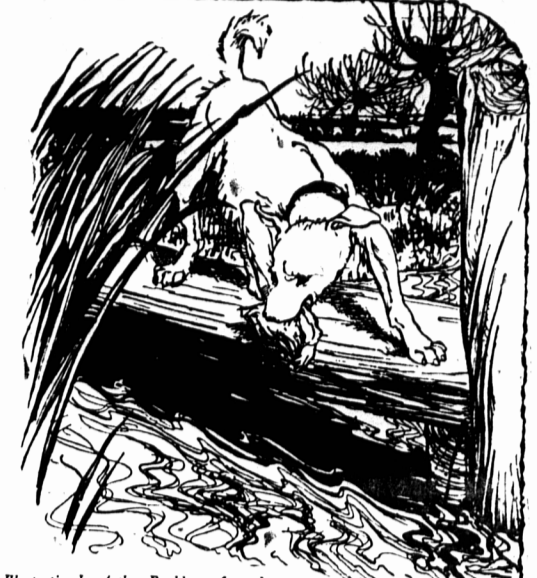
Illustration by Arthur Rackham, from the Heinemann Edition of Aesop's Fables.

MORAL: Make it your first aim to hold on to what is already yours. Open a savings account with The Canadian Bank of Commerce. Add to it steadily. Soon you will find that your money has grown—and without any risk. Visit our nearest branch today.