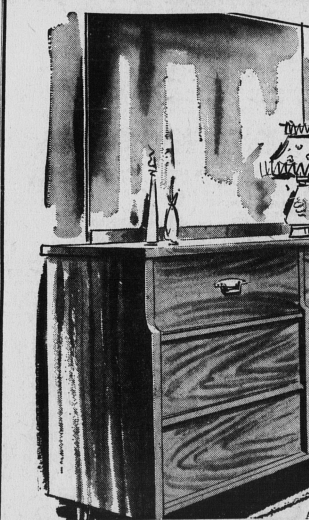
Not Exactly As Illustrated

Finds Healing Substance That Relieves Pains And Itching As It Shrinks Hemorrhoids Toronto, Ont. (Special)—For the first time science has found a new healing substance with the ability to shrink hemorrhoids and to relieve pain and itching. Thousands have been relieved with this inexpensive substance right in the privacy of their own homes without any discomfort or inconvenience. If one hemorrhoid sore after another is very striking improvement was reported and verified by doctor's observations. Pain was promptly relieved. And while gently relieving pain, actual reduction or retraction (shrink) took place. And most amazing of all—this improvement was maintained in cases where doctor's observations were continued over a period of many months! In fact, results were so thorough