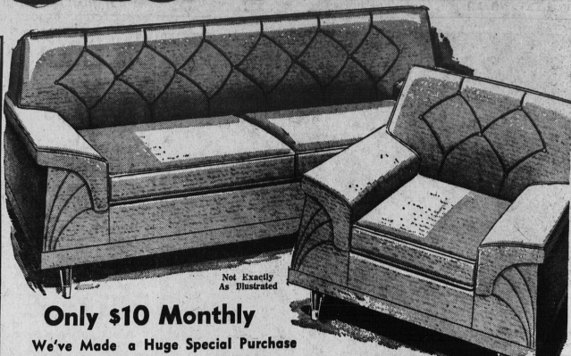
Not Exactly As Illustrated