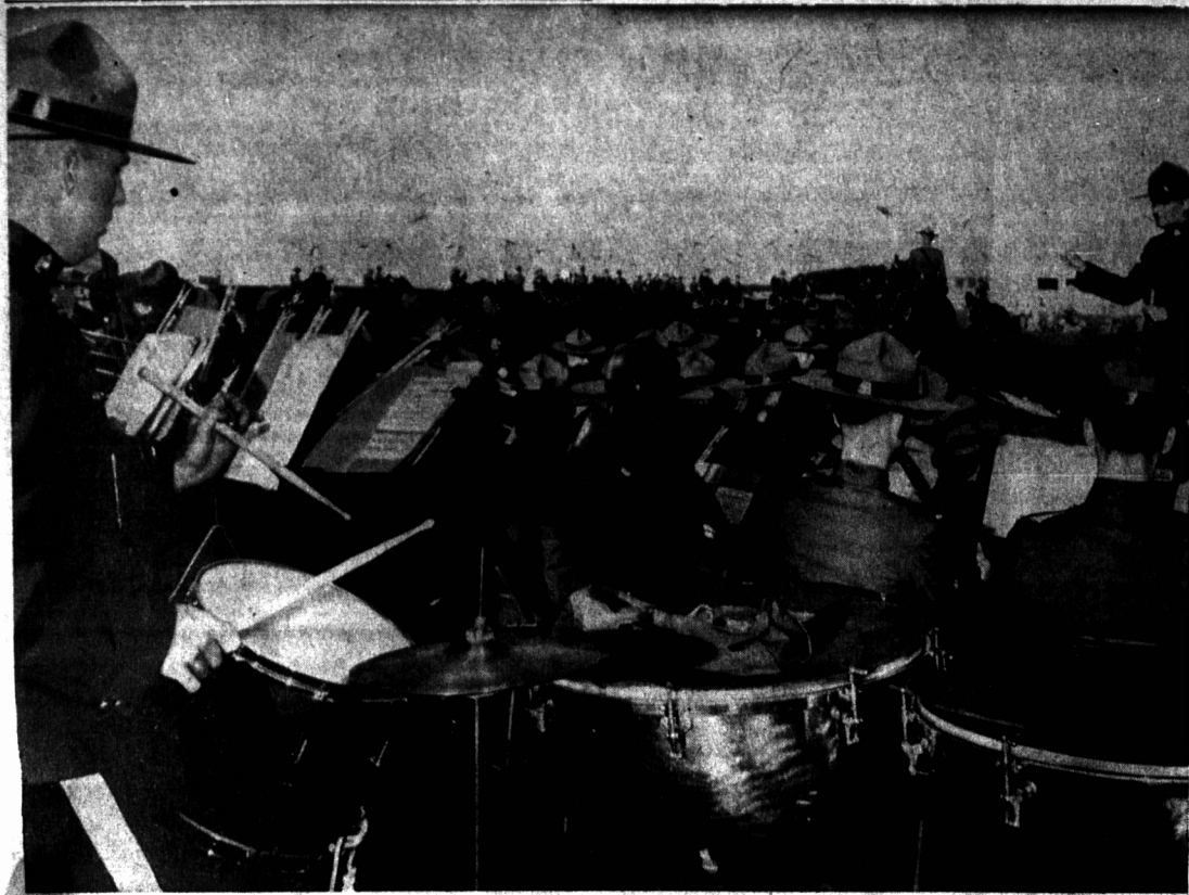
MUSIC FOR FAMOUS RIDE

An RCMP band played at a final dress rehearsal for Commissioner L.H. Nicholson before beginning a 3½ month tour.