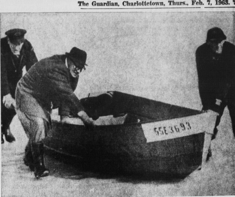
MAKE TREACHEROUS CROSSING SEEKING PET

Pushing their metal duck away family pet from Peeche Island in the Detroit River, the Detroit River these three men Wednesday made a fourth unsuccessful bid to lure a run-