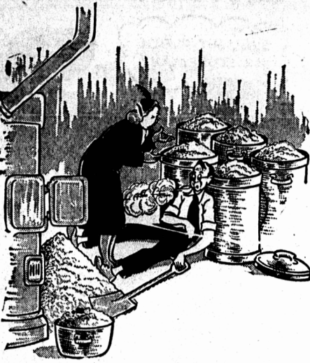
You'll have to hurry Henry, the picture starts at 7:15!