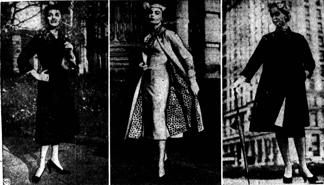
The straight, rounding coat and the fitted coat make up the important silhouettes this spring. There's great variety in styling of the straight coat and even in the length. We show the fitted coat (left) in navy worsted with molded shoulder line. This Ben Zuckerman design has horseshoe collar, is single-breasted. Dress-and-coat ensemble (center) comprise one of spring's outstanding fashions. This particular design is by Mollie Parnis.

By Gaile Dugas NEW WOMAN'S EDITOR NEW YORK—(NEA)—Though the fitted coat is playing a return engagement this spring, the loose flared coat has undergone drastic changes. In its new form, it is straighter and slimmer, with rounded shoulders and sleeves.