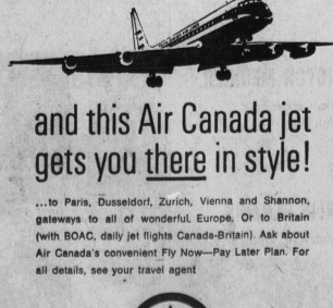
and this Air Canada jet gets you there in style!

carries you up the majestic, snow-covered Alps in Austria, Germany and Switzerland... for skiing or just sightseeing. Meanwhile, down below, another kind of quaint tram-car takes you along the narrow cobblestone streets of Alpine or Bavarian towns... where fabulous shopping bargains, music festivals and exciting trade fairs are just around the corner.