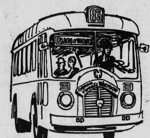
this Paris autobus

takes you through the bustling West End to gay, lively nightspots; to keep a business date in 'The City'... or to a busy British Railways station where your train speeds you to Shakespeare's birthplace. Or along the scenic Cornish coastline, where palm trees grow (yes, in Britain).