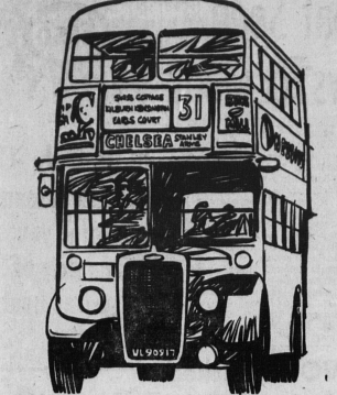
this London double-decker

NEW YORK (AP)—Johnny Keane is expected to sign a two-year contract today as manager of New York Yankees.