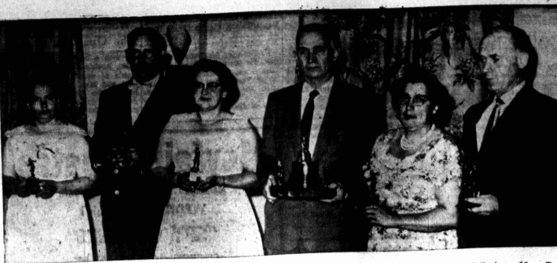
PICTURED above are the winners of the Second Section of the Knights of Columbus Mixed Bowling League who were among the winners who received prizes at the Knights annual bowling banquet held last night at the Clover Club.

Royal Train, Meg, and Ann's Dream were double winners while Brian's Dream, Keppoch Playgirl and Mr. Jollicott won single races.