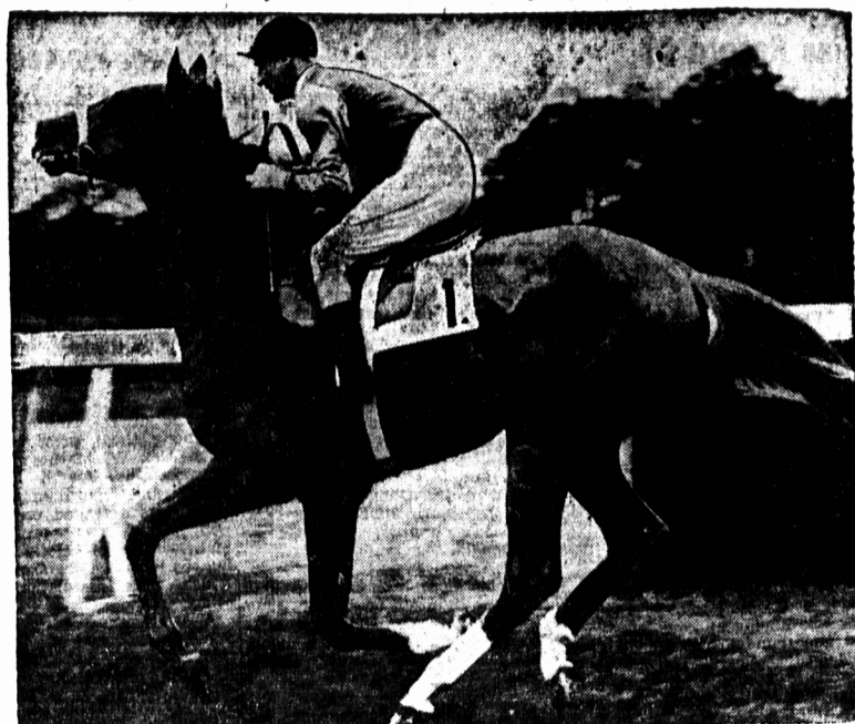
The Queen's colt, Aureole, one of the two favorites in the famous Derby, came second at Epsom Downs. Last Saturday the colt pleased the sport experts by winning the Derby Trial Stakes run over the same distance as the Epsom Derby.